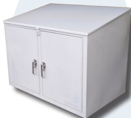
Pumping & Dispensing Cabinet Systems