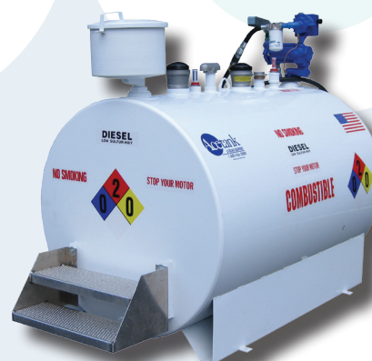
Contractor Pumping System

Phone: (800) 426-2880 E-mail: sales.800@acetank.com