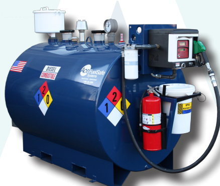
Pumping w/ FMS System