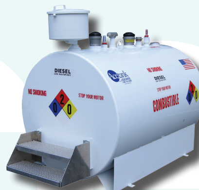
Fuel Oil Supply & Return System