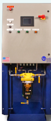
Day Tank System