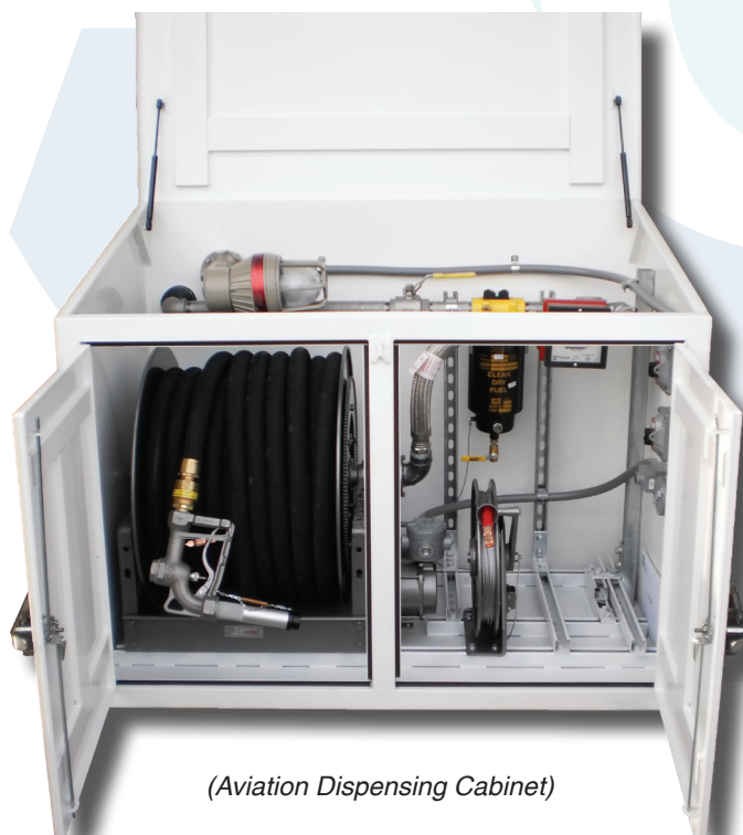
(Aviation Dispensing Cabinet)