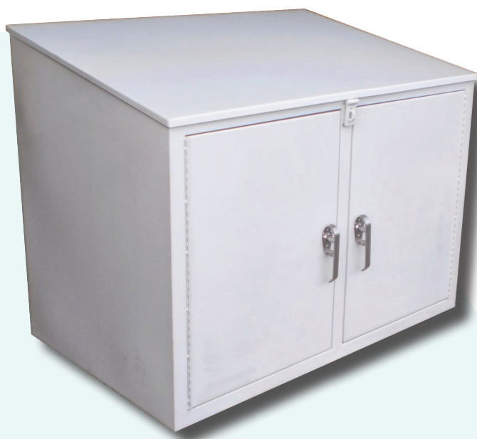
(Aviation Dispensing Cabinet w/ Sloped Hinged Top)

Ace FuelSafe dispensing & pump cabinets are fabricated with the end user in mind. We understand you may have distinctive requirements for your fuel system, so we design our systems to accommodate our client's unique requirements with durability and ease of maintenance in mind. Each system is designed after our sales engineers consult with you to determine your system requirements. Our sales team will help you determine the appropriate pump size, meter, reel, electrical and filtration requirements for your system. FuelSafe cabinets receive a standard powder coat finish, piano hinge doors and lockable door handles. Ace can include leak detection, lighting, extra reinforcement and electrical controls as needed to make certain your system is complete and ready for service once it shows up on site. Ace can also mate up dispensing cabinets with our fuel storage systems for a complete fuel storage and dispensing system. Please call our sales staff to discuss your unique requirements.