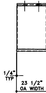
ELEVATION - END VIEW